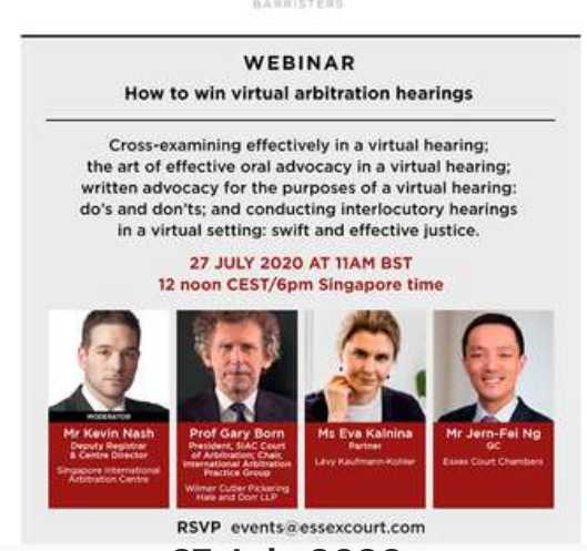
27 July 2020 HOW TO WIN VIRTUAL ARBITRATION HEARINGS BY ESSEX COURT CHAMBERS